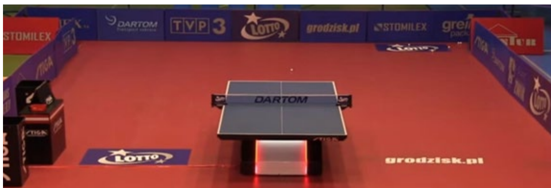
Example show court with BBGs zones