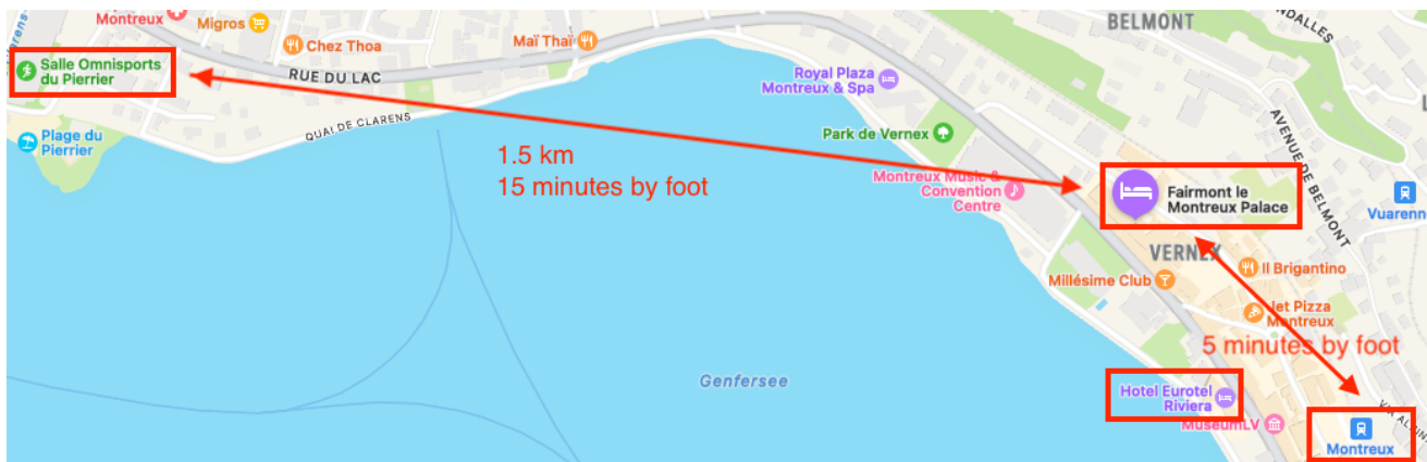
Map of Montreux with Fairmont Le Montreux Palace Hotel and the Salle Omnisport

Enjoy the CCB Europe Top16 Cup Montreux and the beautiful scenery!