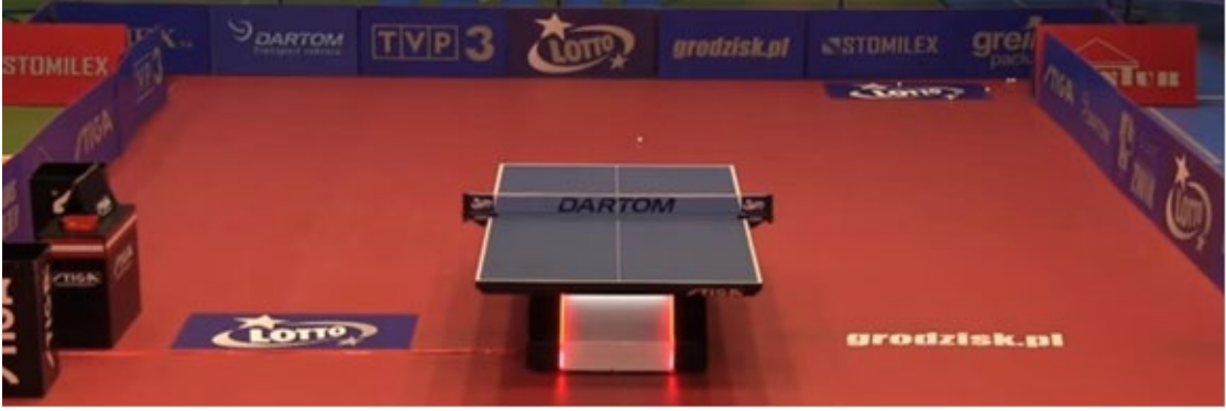
Example show court with BBGs zones

Playing field with designated zones for BBGs.