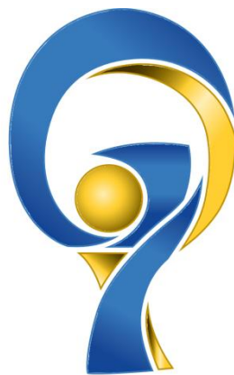
TABLE TENNIS CHAMPIONS LEAGUE

TTCL Men - Licensing Regulations 2016/2017