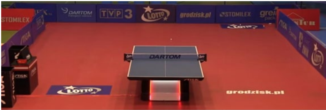
Example show court with BBGs zones