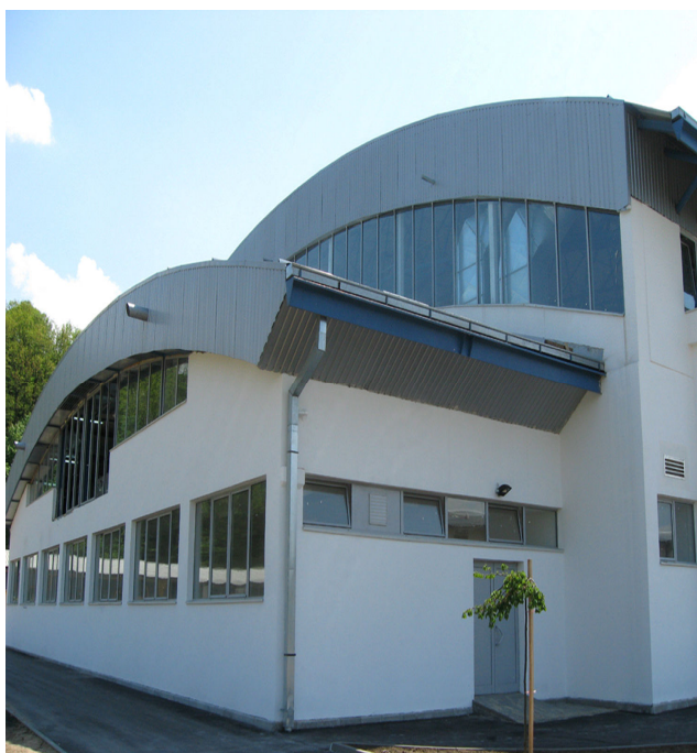
Sportska hala „Vlade Divac“ - Vrnjačka Banja Sports Hall „Vlade Divac“ - Vrnjačka Banja